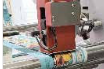
Hx Ultra on VFFS Line