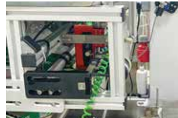
Hx Ultra on HFFS Line