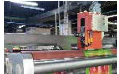
Hx Ultra on HFFS Line

Efficient coding, smarter savings. Upgrade to our bulk ink delivery system. Ideal solution for medium to high-volume production lines